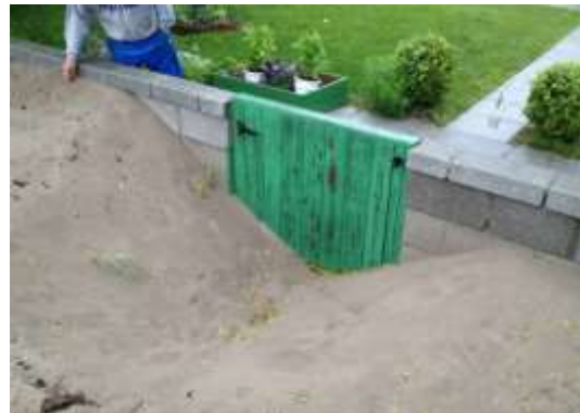
Dune sand pushing up against a property barrier wall.

Taking a few simple steps today can help keep your shoreline healthy for tomorrow!